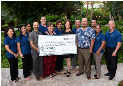
Building for the Future: Gather FCU's $150,000 pledge toward Wilcox Hospital's $4.5 million project in rebuilding their Emergency Department and Trauma Center.

NEWS FOR THE MEMBERS OF GATHER FEDERAL CREDIT UNION